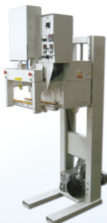
Constant heat with vacuum 直熱式外抽真空封口機