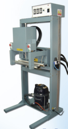
For Powder 粉末外抽真空封口機