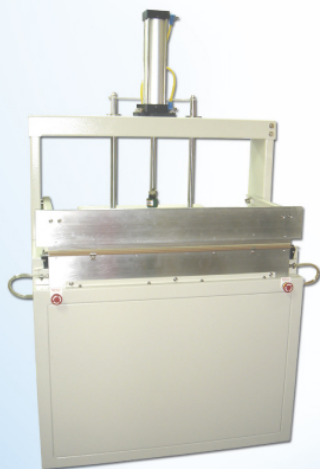
For Quilt, Blanket, Down Jacket 棉被、毯子、羽絨衣、羽絨被